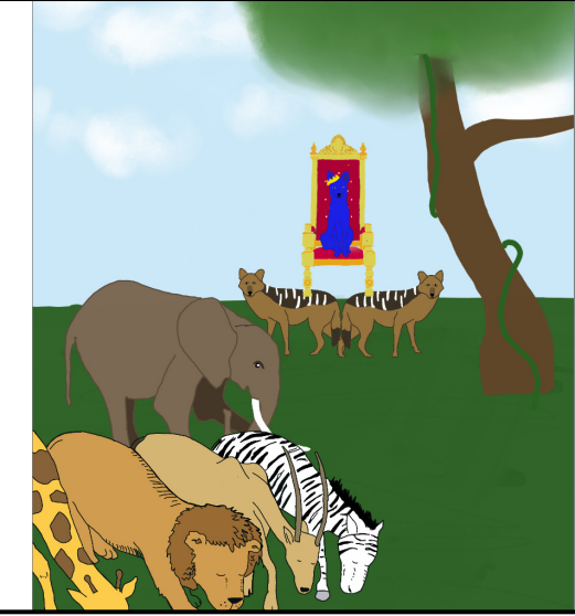
The animals of the jungle started to bow before the jackal and praise the king! The jackal greeted and thanked the loyal animals except for his own kind! So the other jackals devised a plan, they were going to howl and if the king howled with them he was normal

The moral of the story is to be true to yourself! Don't pretend to be someone you are not!