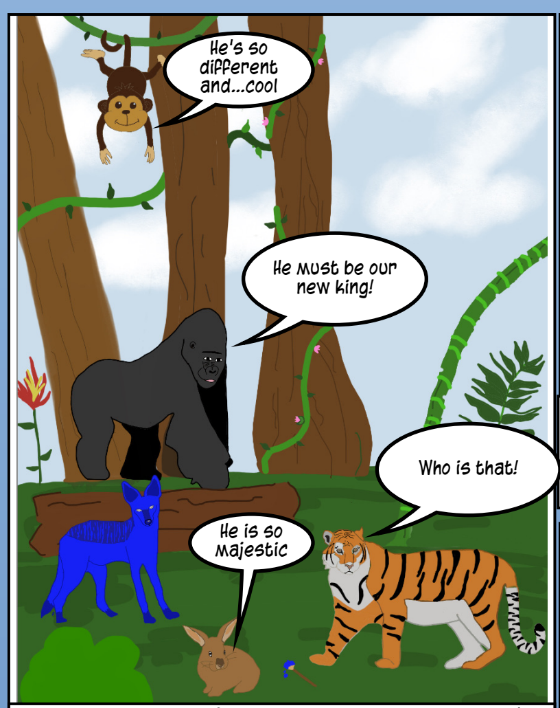
The Jackal rushed out of the house and ran into the jungle. As the jackal entered the jungle, animals started whispering about the new strange creature. The animals came to a conclusion that the jackal must be their king because of his bright blue color.

The moral of the story is to be true to yourself! Don't pretend to be someone you are not!