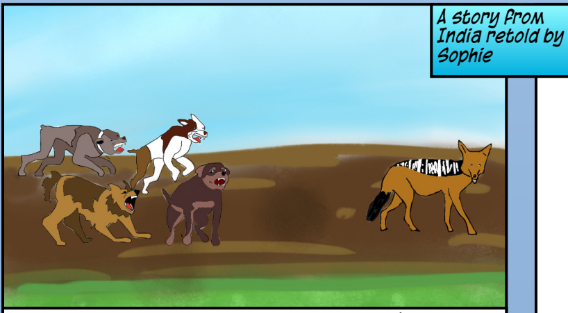
There was once a scared, and skinny jackal. As this jackal was walking through a village, a pack of dogs started to chase it.