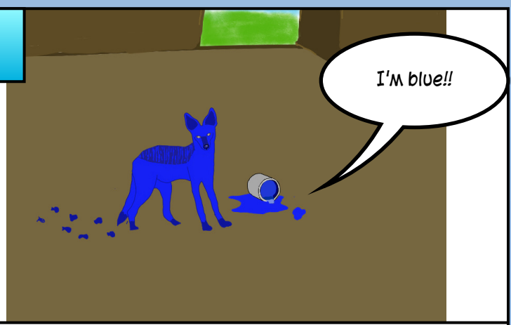
The jackal decided to run into a painter's house to escape the dogs, and accidentally tripped over a blue paint bucket